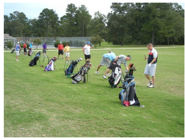
Warming up at Baywood Golf Club before the shotgun start.

See "Spotlight" on page 5 for a list of sponsors and donors.